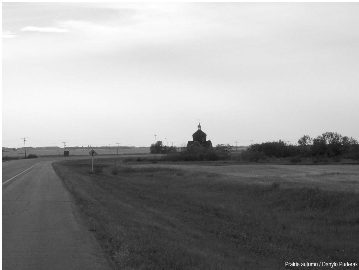
Prairie autumn / Danylo Puderak

2007 Nation Builders & Community Recognition honourees announced page 11