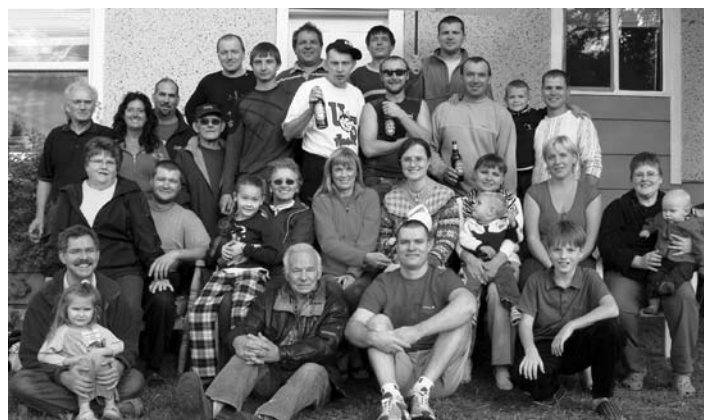
With members of North Battleford's Ukrainian community

About 100 recently arrived Ukrainians visited Ukraine Day in the Park (please see page 17), and it was gratifying to see them participating in and volunteering at this event. A week earlier, they enjoyed the popular Kar-