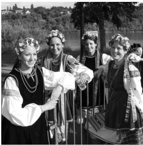
Fourteen performing groups from Toronto, Lviv, Winnipeg, Prince Albert, Wishart, Drake and Saskatoon provided a dynamic program of entertainment on the large outdoor stage. Above: members of Wishart Hopak Dancers.