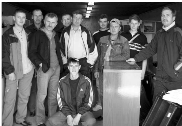
At the UCC-SB storage facility with donated household items

The UCC-SB wishes to thank its partners: the UCC-SPC, the Immigration Branch of the Saskatchewan Government, Immigration Support Services, HR managers at companies who invite Ukrainian workers, SGI, and all the volunteers for their kind cooperation. ■