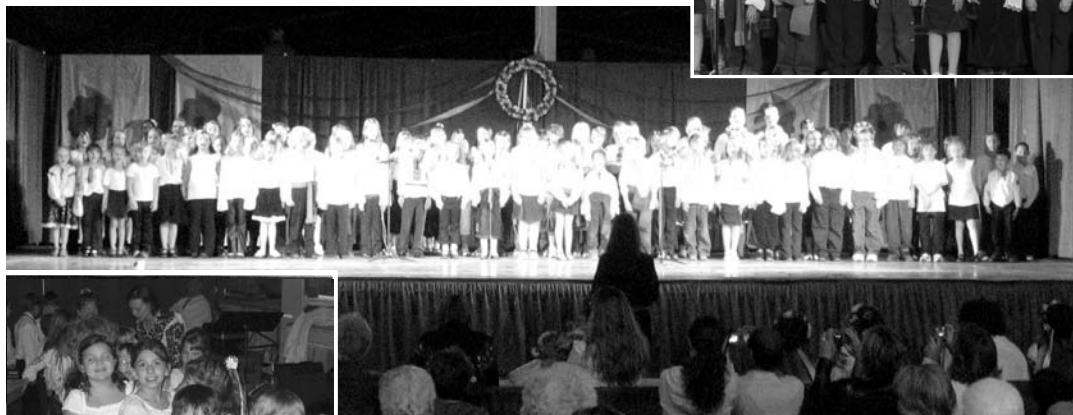
Singing at UCC Regina's Preview Night. At left, students backstage.