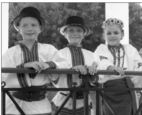
Saskatchewan's only outdoor Ukrainian festival was presented by the Ukrainian Canadian Congress – Saskatoon Branch with event partner New Community Credit Union