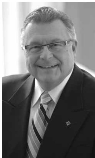
Ralph Goodale Member of Parliament Wascana

310 University Park Drive Regina, SK., S4V 0Y8 (306) 585-2202 goodale@sasktel.net